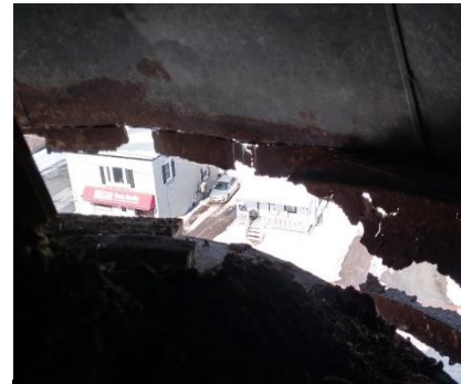
Turret wind damage

We greatly appreciate any contributions!